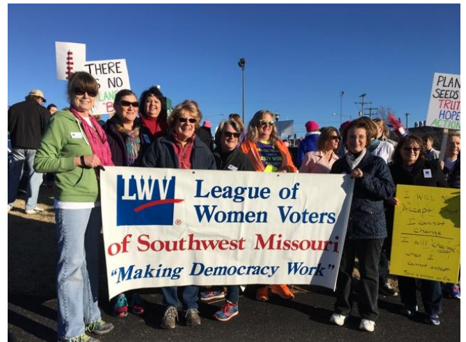
League members at the start of the march.