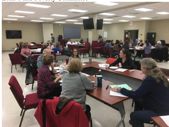
Environmental Sustainability Committee