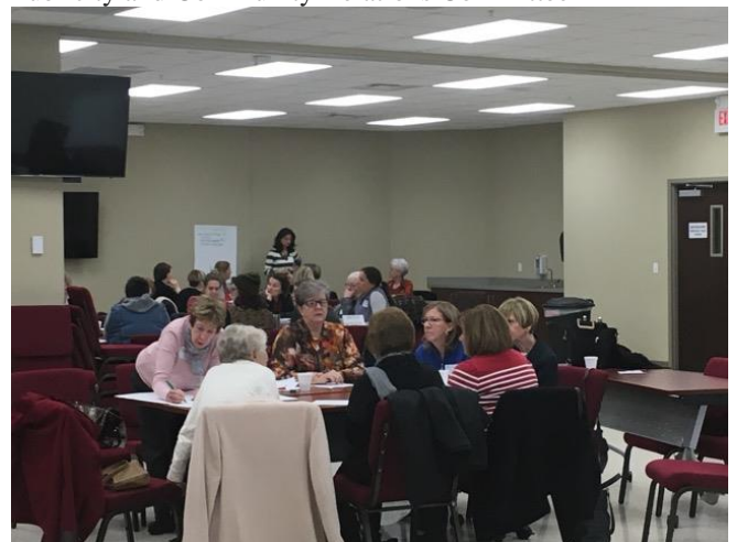
Mental Health Committee