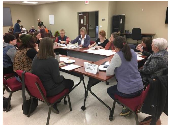
Voter Outreach Committee

We left there with 8 new committees who will be having their first planning meeting in the next month or so: Money in Politics, Photo Voter ID, Voter Outreach, Publicity and Community Relations, Zone 1 and Poverty, Legislative Action, Environmental Sustainability, and Mental Health. If you had to miss this event, we will send out a separate email detailing the plans for each committee and the date/time/location of their first meeting.