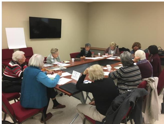
Zone 1 and Poverty Committee