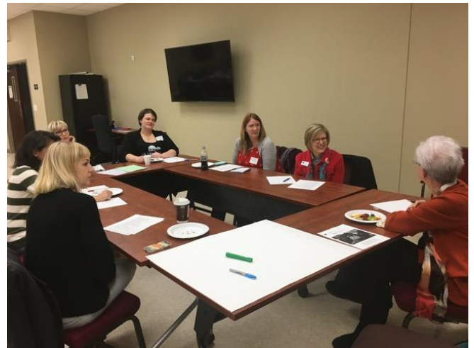
Publicity and Community Relations Committee