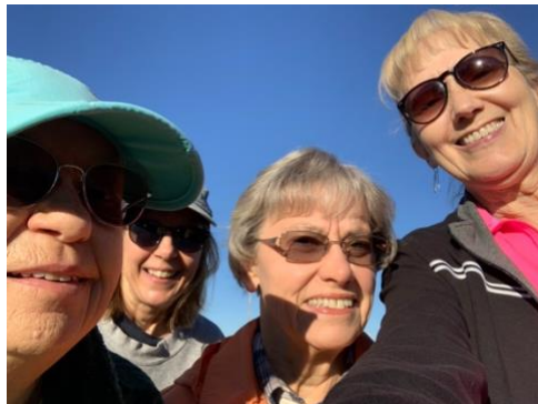
Later that week, on October 21, we picked up trash along Sunshine Street.