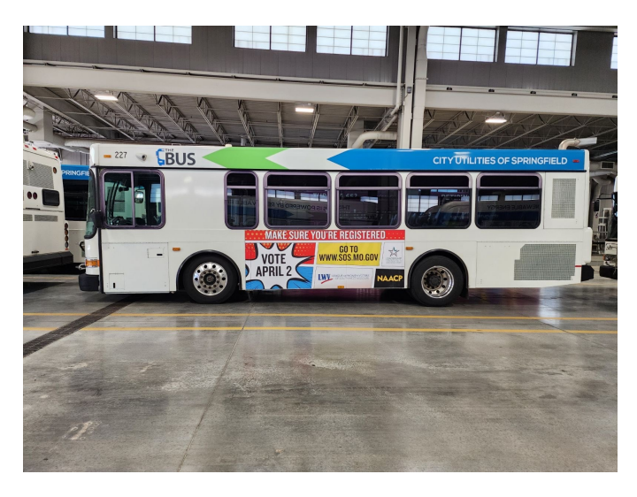
Look for the bus as you're driving around town!

Thanks to a collaborative effort with Leadership Springfield and NAACP, the bus wrap is rolling! Funding for this project was acquired from a grant award from the League of Women Voters of Missouri and private donations from two individuals. Voter turnout has been a Red Flag in the Community Report since 2004. Bringing attention to Election Day is a way to encourage and remind voters to exercise their right to vote.