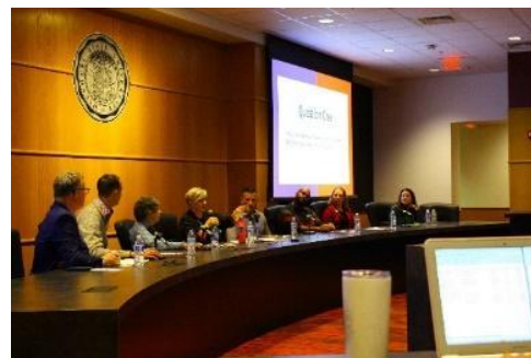
Paws to the Polls produced our "What's on Your Ballot" voter guide for the April 2nd municipal election and

held a local election candidate forum on March 27th on campus. We also tabled at the April 2nd election, setting up shop outside the Central Polling Location at the Welcome Center to answer questions and award voters with "I Voted" buttons.