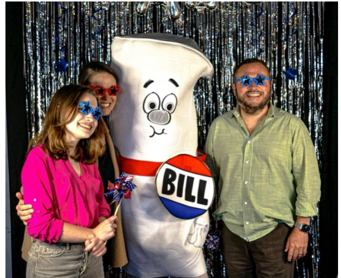
Our mascot "The Bill" from Schoolhouse Rock was on hand to pose for photos with enthusiastic guests. Don't miss our next trivia night this fall!

The event was at maximum capacity for the venue, and members of the winning team (The 3 Amigos) received our Vote Tote filled with great swag.