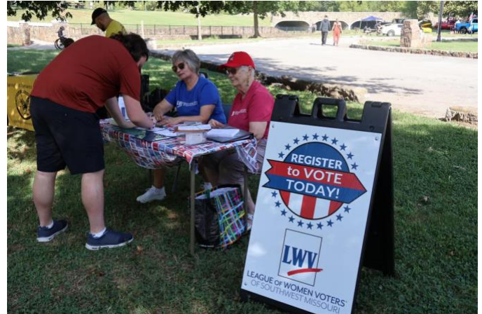
Photo: 1 League Members registering voters at the Labor Day Parade